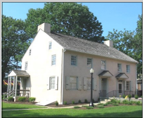
THE JENKINS HOMESTEAD