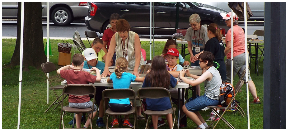
CHILDREN ENJOY THE 2015 SUMMER HISTORY CAMP.

If you are unsure whether you've paid or not, please call (215) 855-1872. We'll be glad to check on your status.