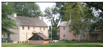
The Jenkins Historic Complex

Lansdale Historical Society 137 Jenkins Ave., Lansdale, PA 19446